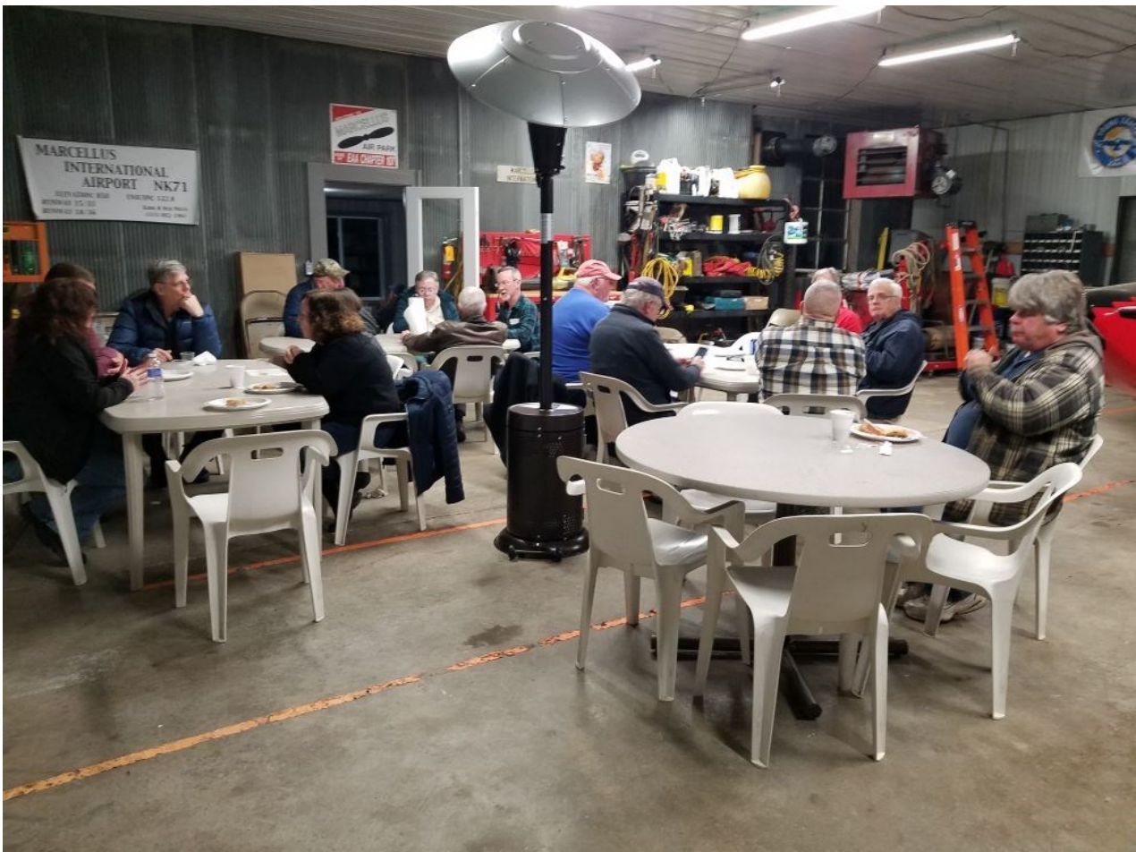
A photo of our Christmas party

Marcellus, NY 13108 Ph: 315-673-4534 kkiniry@gmail.com