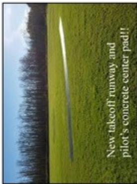
New takeoff runway and pilot's concrete center pad!!

Saturday, May 18, 2024 Rain Date: Sunday, May 19, 2024 10 AM to 4:00 PM