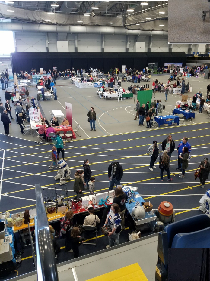
Maker Faire- overall view