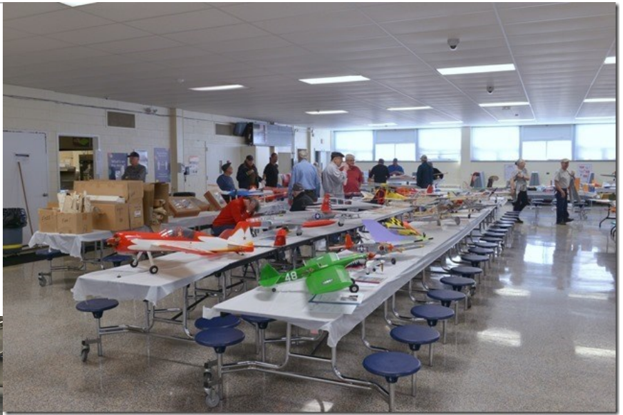
Static Displays at the MAF