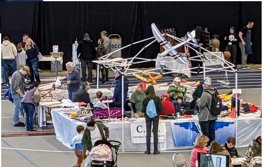
Maker Faire— Our Booth