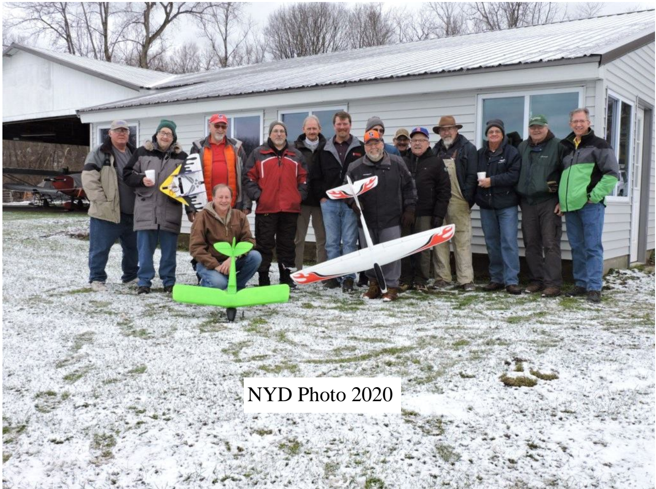
NYD Photo 2020

Marcellus, NY 13108 Ph: 315-673-4534 kkiniry@gmail.com