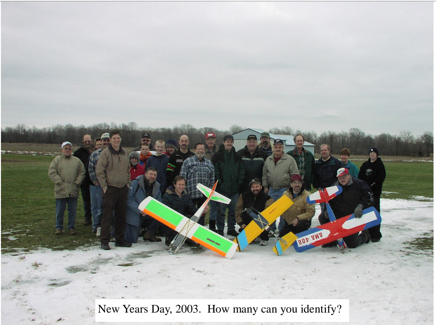
New Years Day, 2003. How many can you identify?