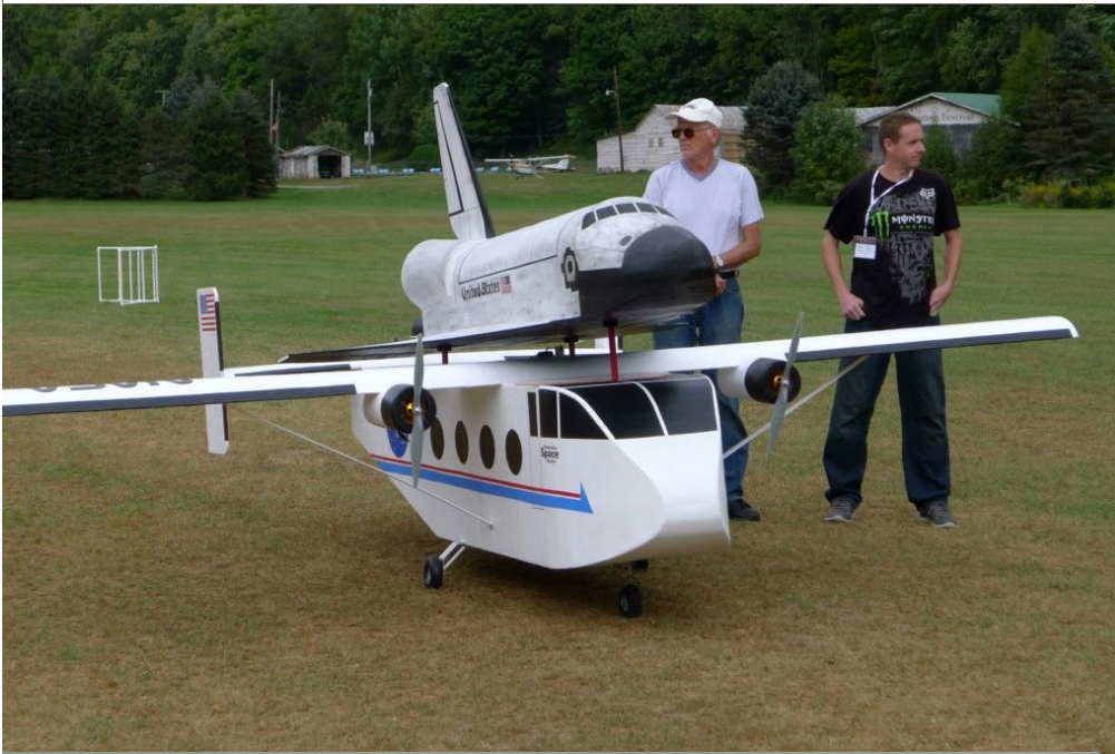
Neat Fair Photos