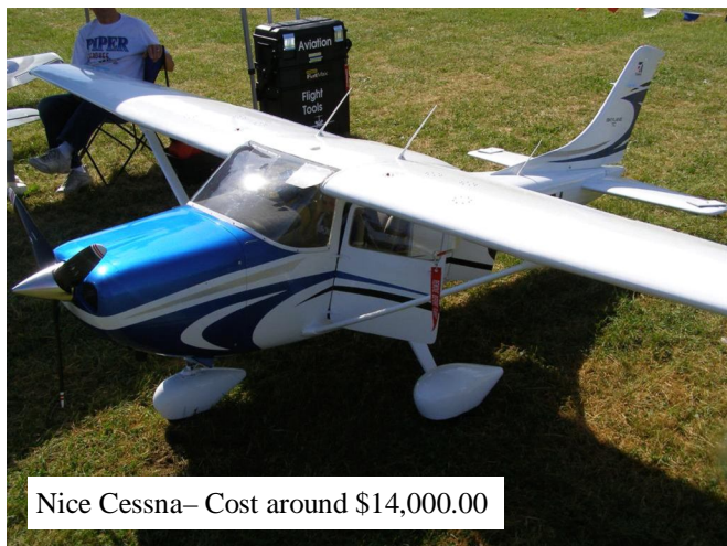
Nice Cessna- Cost around $14,000.00