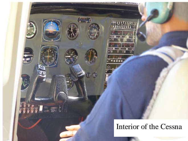
Interior of the Cessna