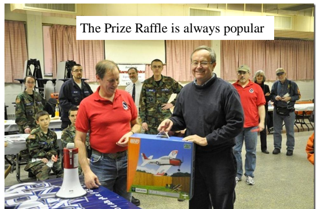
The Prize Raffle is always popular