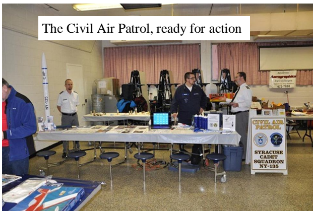
The Civil Air Patrol, ready for action

The Academy of Model Aeronautics, founded in 1936, represents 143,000 aeromodelers and 2,400 clubs throughout the United States. The AMA sanctions more than 2,000 events and competitions every year.