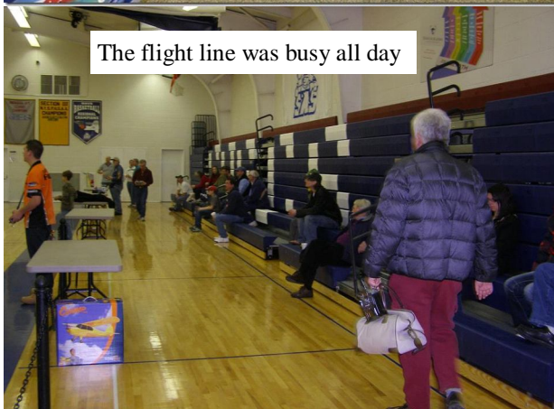
The flight line was busy all day