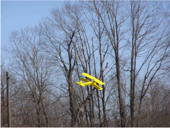
My Tiger Moth