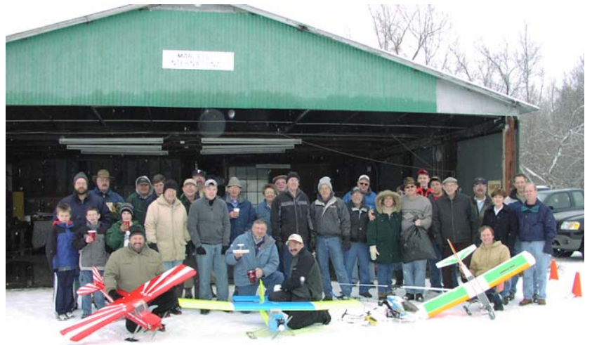
A Cold, Happy Bunch.