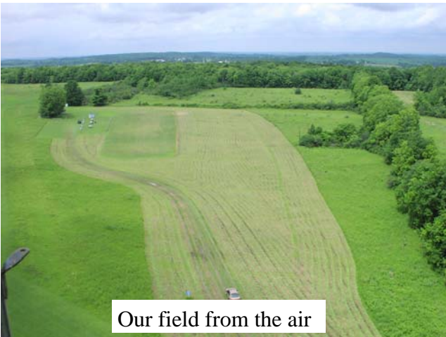
Our field from the air