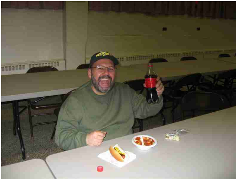
It doesn't get any better than this!